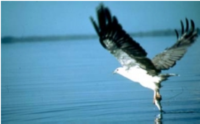
The White-bellied Sea-Eagle fishing.

Like the Wedge-tailed Eagle, the White-bellied Sea-Eagle builds very large nests. Nests can be very conspicuous being made of sticks lined with leaves and, as new material is added, can become very large. They can be used for years in succession. One or two whitish-yellow eggs are produced usually between April and August, but the timing of breeding can vary.